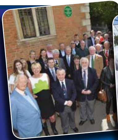
Unveiling a Green Plaque for General Jack