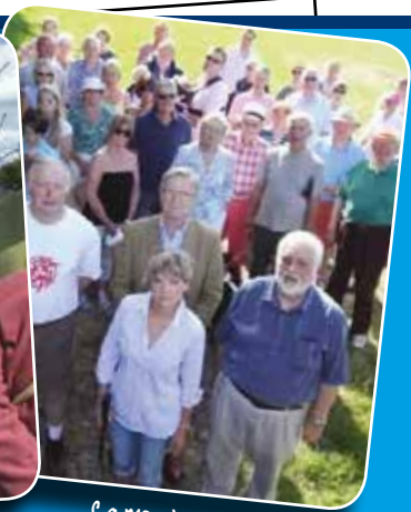
Campaigning against a wind turbine

WE'VE KEPT COUNCIL TAX INCREASES BELOW INFLATION FOR THE LAST 4 YEARS