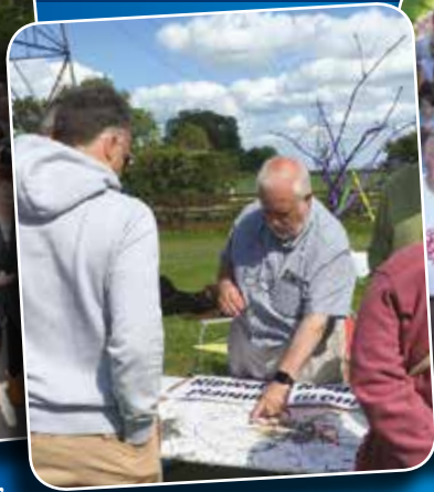
Helping out at a Neighbourhood Plan event